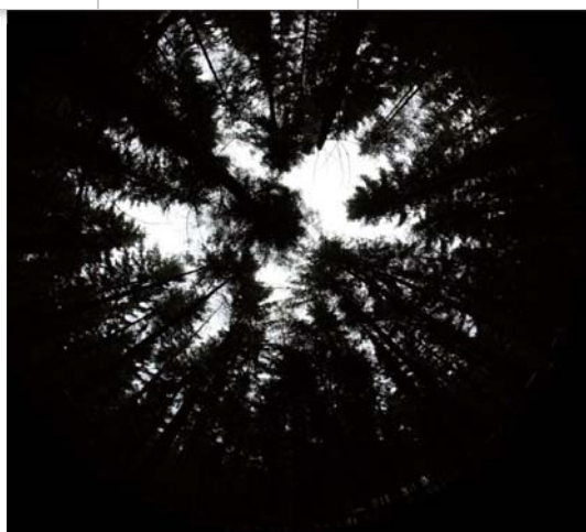
Digital Hemispherical Picture from Hyltemossa station on 18 November 2017 14:04