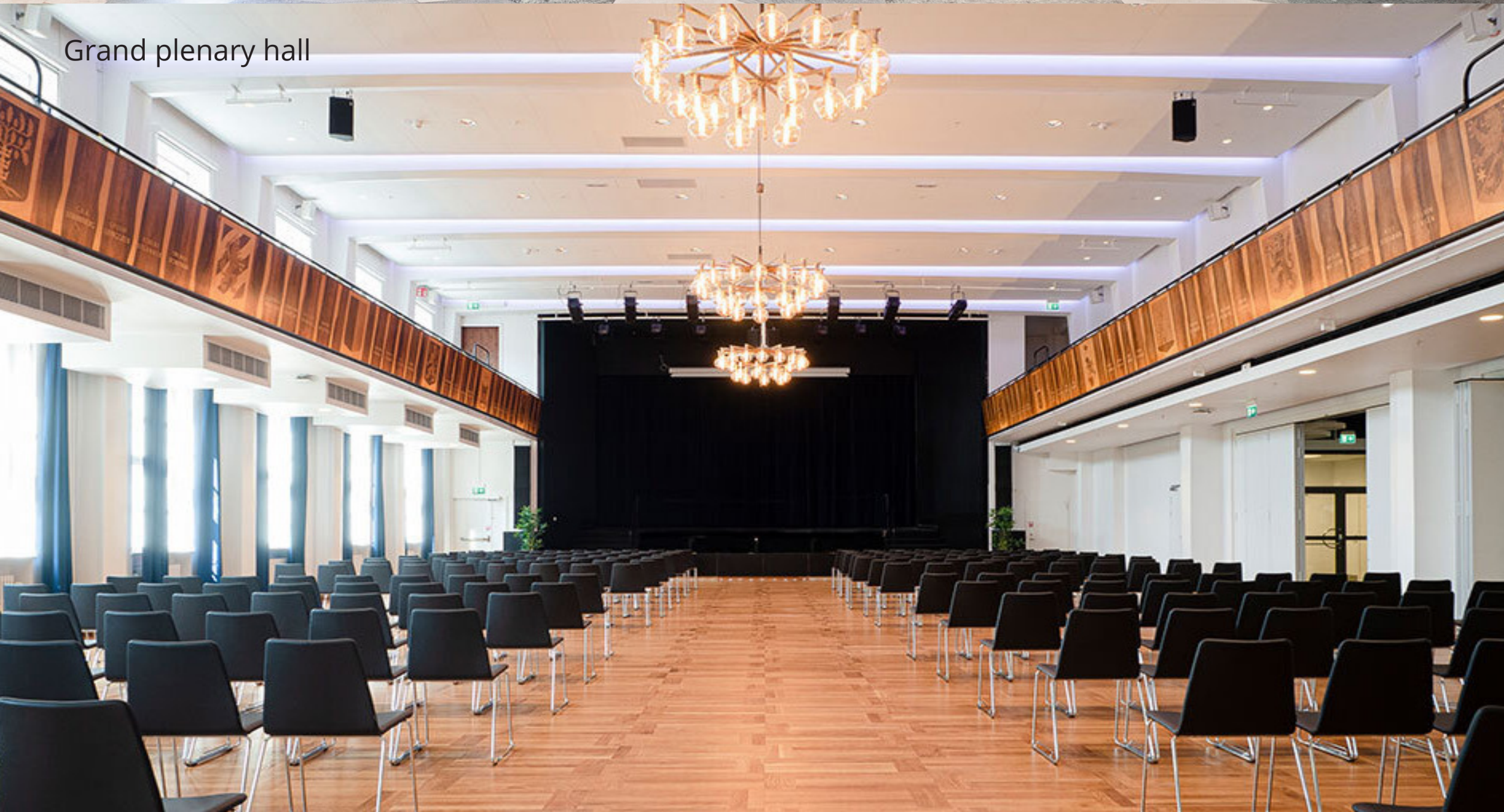
Grand plenary hall