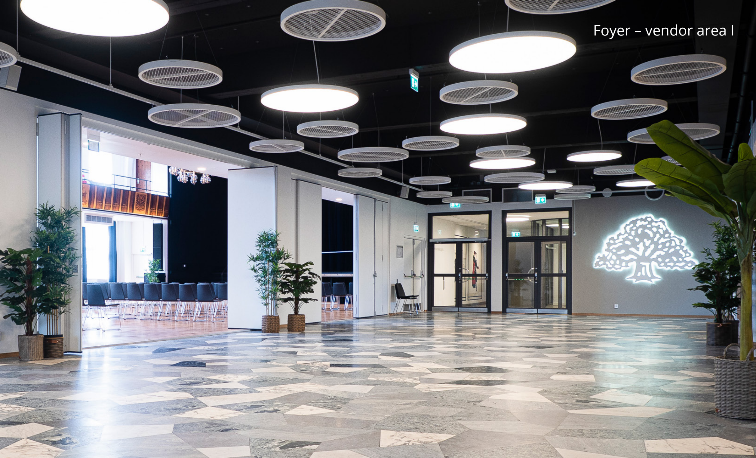
Foyer – vendor area I